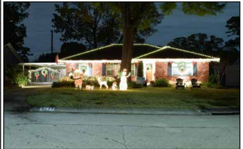
Best Decorations with Wreaths

ALTHOUGH DOOR PRIZES ARE ON HOLD DUE TO COVID, PLEASE CONTINUE TO SUPPORT OUR GENEROUS LOCAL BUSINESSES!