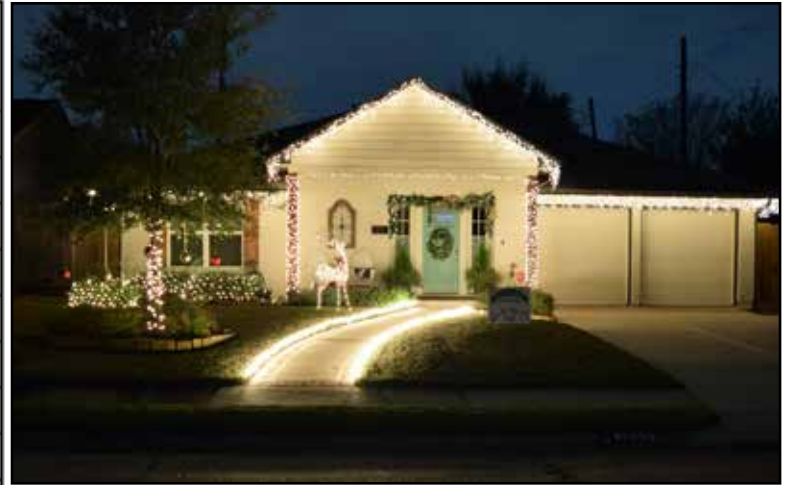
Best Front Door Decorations